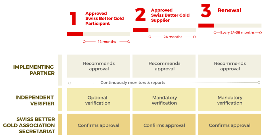
Figure 2: Swiss Better Gold monitoring and verification process, elaborated by the Swiss Better Gold Association